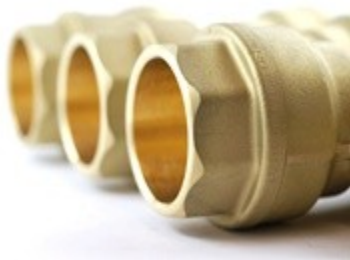
Product sample ISIFLO brass

Isiflo universal couplings from 16 mm to 63 mm outside diameter are certified in accordance with G 5600.1 for the gas sector (only in conjunction with conversion kit gas type 990 and pipe booster type 180) in accordance with DIN 8076 for the water sector up to 90 mm outdoor diameter.